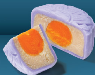
冰皮芋蓉单黄 Snow Skin Yam Single Yolk RM 23.30