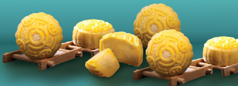
冰皮猫山皇 Snow Skin Musang King RM 138.80 (6pcs x 85g)