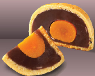
上海芋蓉单黄 Shanghai Yam Single Yolk RM 23.80