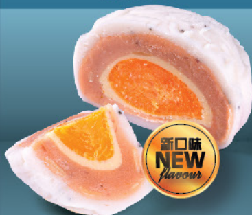
冰皮玫瑰椰子奶单黄 Snow Skin Rose Coconut Milk with Single Yolk RM 23.50