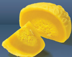
冰皮鲜榴莲 Snow Skin Durian Coulis RM 23.90