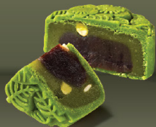
桃山皮绿茶红豆 Momoyama Green Tea With Red Bean RM 23.80