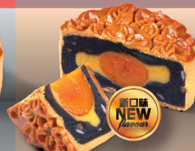
黑芝麻杏仁奶皇单黄 Black Sesame with Almond Custard Single Yolk RM 23.50