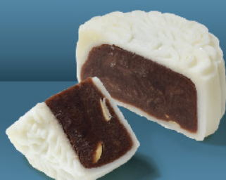
冰皮豆沙 Snow Skin Red Bean RM 17.30