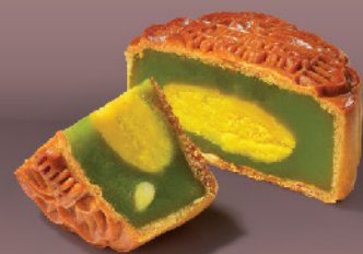
翡翠奶皇 Jade Custard RM 22.80