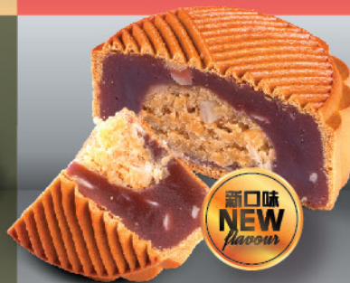
紫薯金沙肉松 Purple Potato Honey with Salted Egg Chicken Floss RM 23.50