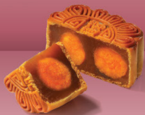
双黄莲蓉 Lotus Double Yolk RM 24.90