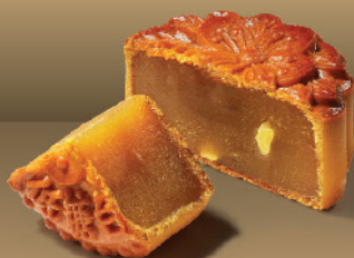
纯白莲 Pure White Lotus RM 22.30