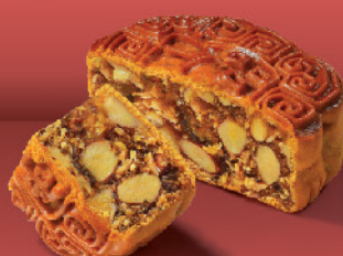
伍仁赏品 Assorted Fruits And Nuts RM 24.50