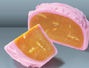
冰皮莲蓉 Snow Skin Lotus RM 21.80