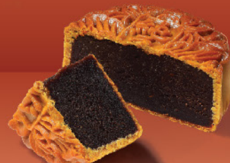
纯豆沙 Pure Red Bean RM 17.00