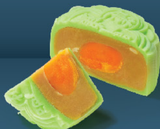
冰皮单黄莲蓉 Snow Skin Lotus Single Yolk RM 23.30