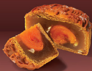
单黄莲蓉 Lotus Single Yolk RM 22.80