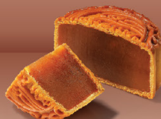
纯莲蓉 Pure Lotus RM 21.30