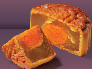
白莲单黄 White Lotus Single Yolk RM 23.80